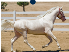
Tennessee Walking Horse

This breed of horse typically has an eye-catching spotted coat and striped hooves.